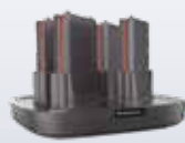
94ACC0192 4-slot Battery Charging Dock