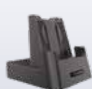
94A150095 Single Slot Charging Dock